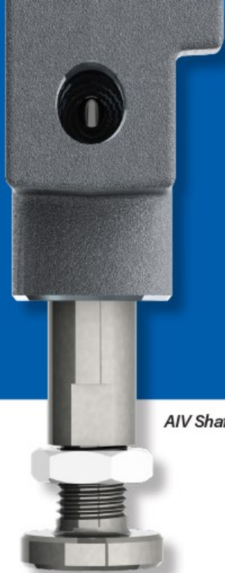
AIV Shaft View